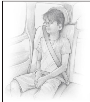
Figure 6. Lap and shoulder seat belt.