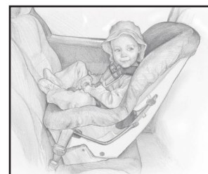
Figure 2. Convertible car safety seat used rear-facing.