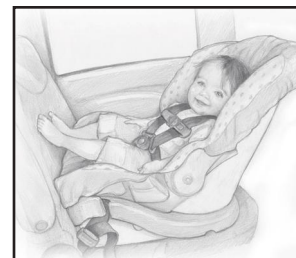
Figure 1. Rear-facing-only car safety seat.